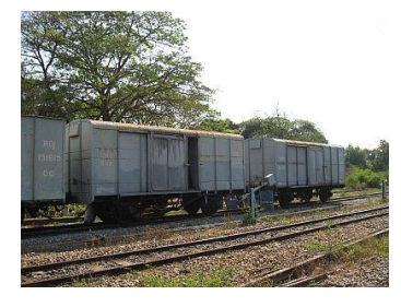
WWII train cars at Non Pladuk

I arrived in Bangkok on February 23<sup>rd</sup> and was kindly driven to Kanchanaburi by the driver of my wife's aunt and uncle who live there. On the way we stopped at Ban Pong – the original staging center for