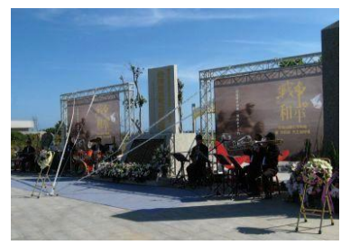
The band playing by the memorials