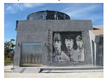
Museum for the Taiwan veterans in the park

The area has now been turned into a beautiful park with lovely landscaping complete with walkways, park benches and a small museum to further tell the story of those who were involved in the conflicts of the 20<sup>th</sup> Century. The Society will also be contributing some materials to the museum to help tell the story of the Taiwan POWs.