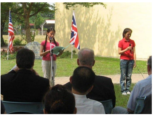
Gou-Ba students present the history of the POW camp in English and Chinese