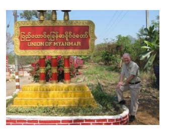
At the Myanmar Border

After spending some time looking around, we headed back south and soon Rod pulled off the road again. We traveled across country for quite a while and finally ended up in the area of the three Tha Khanun Camps. We spent several hours exploring the old rail bed for