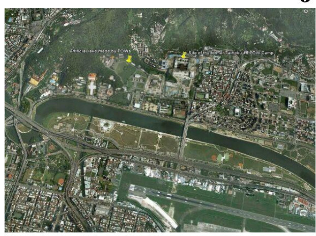
Satellite locations and views of all the former Taiwan POW camps now up on the Society's website