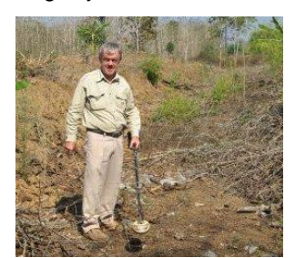
Searching for rail spikes

We stayed that night in Sangklaburi and the next day we headed north toward Three Pagodas Pass and the border with Burma (Myanmar). On the way, Rod pulled the Rover off the main road and headed down a narrow dirt trail til we came to the site where the old railway