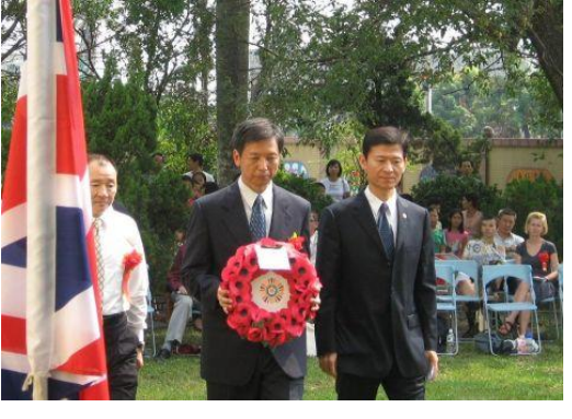
Lt/Gen. Pang - ROC Veterans Affairs Dept. laying a wreath in tribute to the POWs