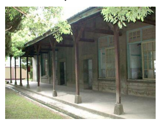
Old Japanese school building – the last POW structure in Taiwan – torn down in November 2003.

The men occupied the former buildings of what is now the Gou-Ba Elementary School. The school had been in operation then for 26 years under the Japanese occupation, and the students were moved out so the prisoners could be housed in their classrooms. The men slept on the cement floor of the classrooms and each was given 2-3 cotton blankets – that was all they had for a bed.