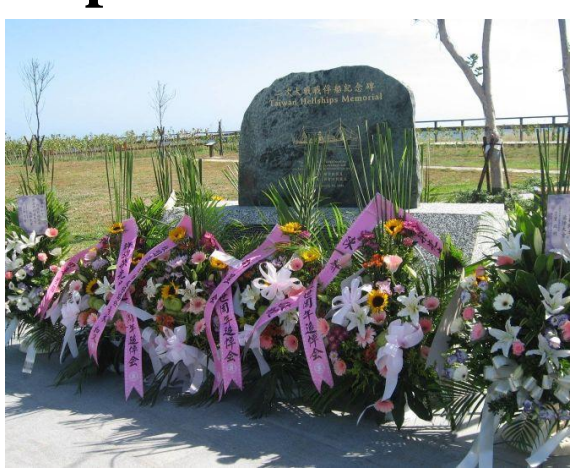
Dedication of the Taiwan War & Peace Park at Kaohsiung Harbour – May 20<sup>th</sup> - Site of the Taiwan Hellships Memorial