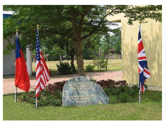
Dedication of the POW Memorial on the site of the former Toroku POW Camp – June 6th